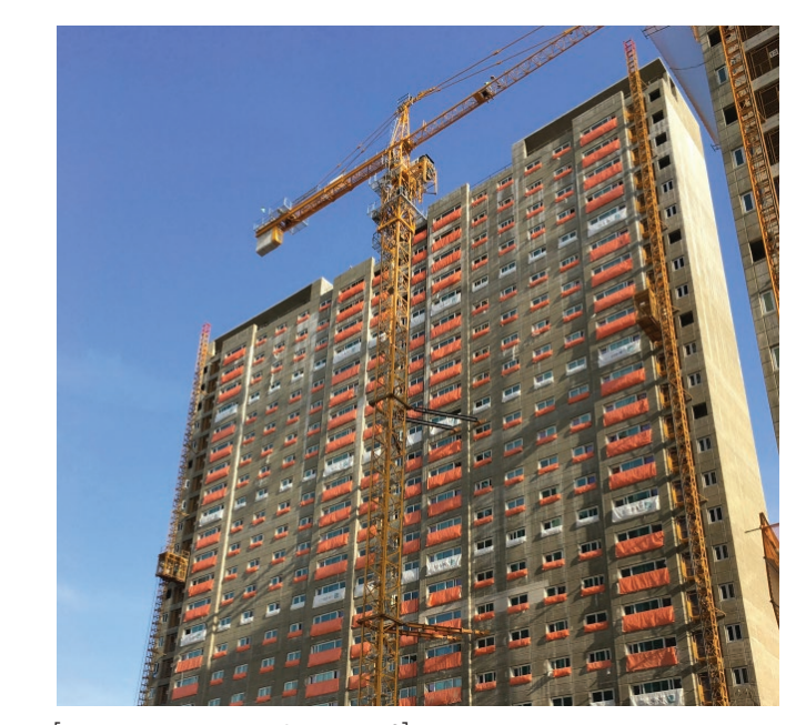
[Dismantling of Tower Crane No. 3]

In response, in January 2018, the Ministry of Land, Infrastructure and Transport (MOLIT) Busan Regional Office inspected all tower crane sites in the Yeongnam region, Ssangyong E&C successfully passed